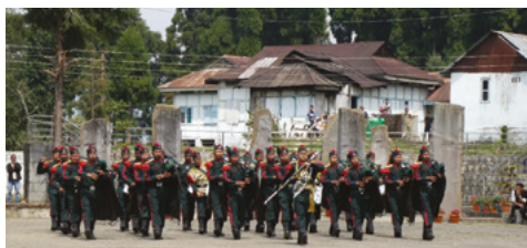
The Pipes and Drums Band (Assam Rifles)