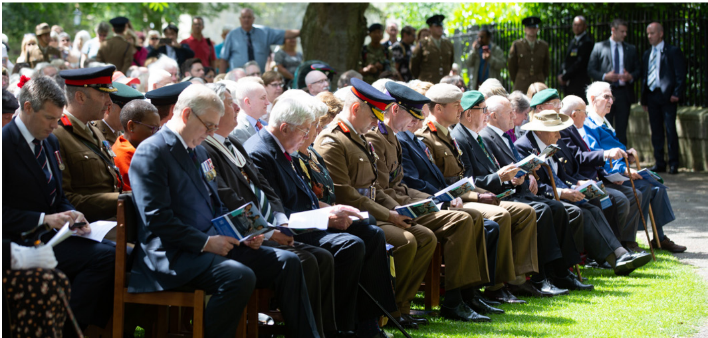
Veterans gather in Dean's Park to commemorate the 75th Anniversary of the Battle of Kohima

Our thanks also go to the soldiers of 2PWRR and 2nd Signal Regiment who turned out in force on the day shaking buckets on the streets of York collecting just under £1200.