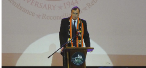
The Honourable Sir Dominic Asquith KCMG. British High Commissioner