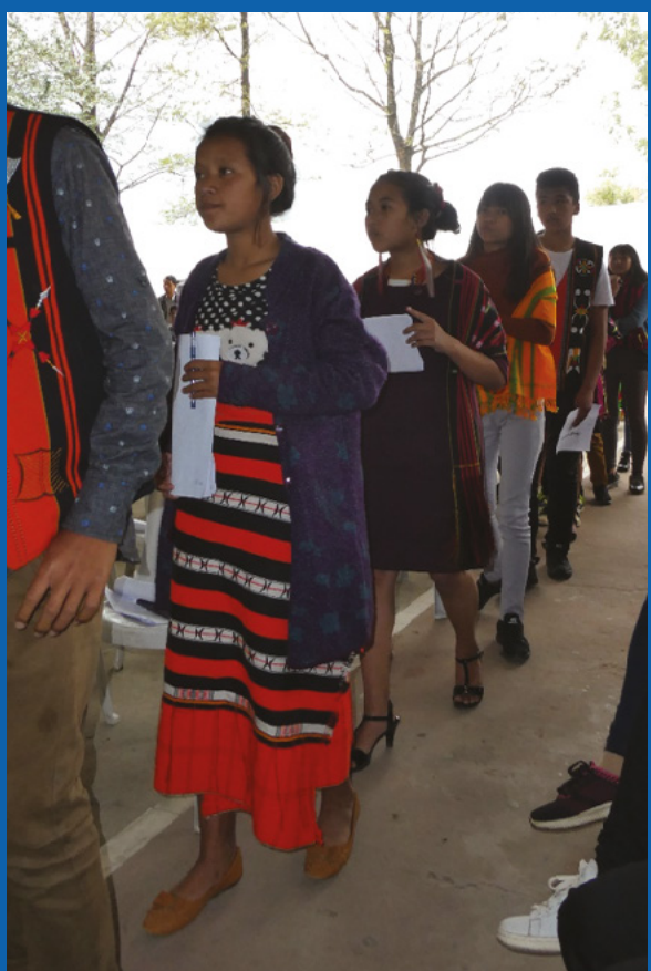
Students lining up to receive their award