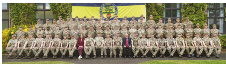
Corporals attending the day which included a Battalion parade and delicious curry lunch