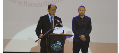
The Honourable Chief Minister of Nagaland, Mr Neiphiu Rio