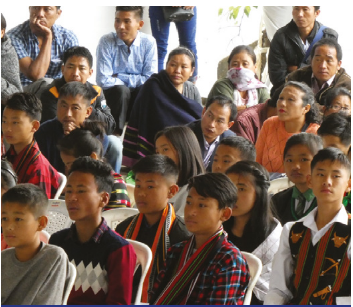
Students waiting to be called up with their parents in the background

Students are encouraged to write to their sponsors each year and we take photographs at the annual ceremony which is held in March each year.