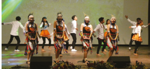
Singers and dancers combined traditional with modern during the opening ceremony